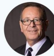
Vito Di Noto

Nobel Laureate in Chemistry 2019 for Lithium ion Batteries